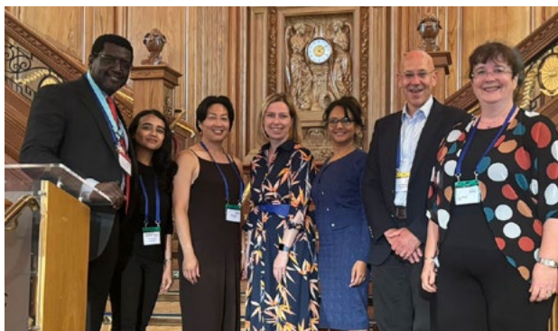
SOM Board members at our Annual Conference 2024 in Belfast

We would be happy to discuss bespoke opportunities with you. Feel free to contact us with your ideas.