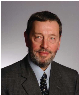
The Rt Hon the Lord Blunkett

The SOM proactively works with policy makers across the UK. Our Patrons are Lord Blunkett, Dame Carol Black and Sir Norman Lamb MP. We work globally through our international regional group and the International Occupational Medicine Society Collaborative.