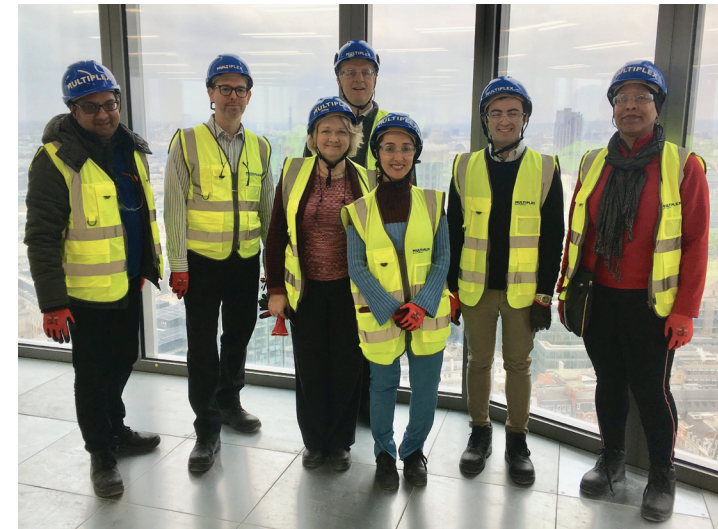
The SOM team on a site visit in London in March 2019

We can promote details of the latest vacancies in occupational health and medicine. Full members of the SOM receive job alerts, and are among the first to know when opportunities arise.