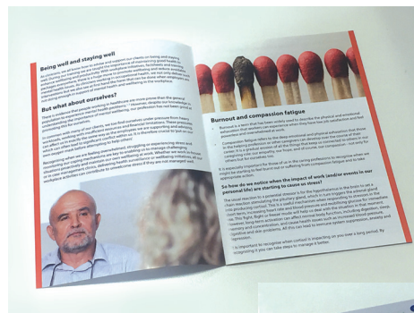
Looking after your mental wellbeing: A guide for Occupational Health Practitioners