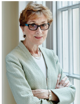
Dame Carol Black