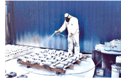
Winner of the SOM Christmas photo competition.

We have details of the latest vacancies in occupational health and medicine. By being a member you can receive for job alerts, and to be among the first to know when opportunities arise.