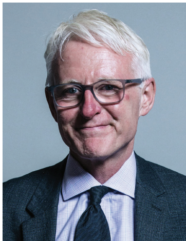
Rt Hon Norman Lamb MP