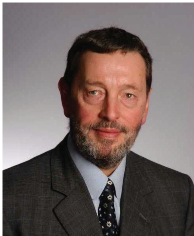
The Rt Hon. the Lord Blunkett

The SOM proactively works with policy makers across the UK. Our Patrons are Lord Blunkett and Norman Lamb MP. We work globally through our international regional group and the International Occupational Medicine Society Collaborative.