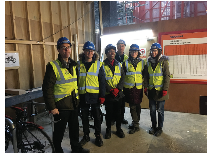
The SOM team visiting a Skanska building site in London in December 2017

We can promote details of the latest vacancies in occupational health and medicine. Full members of the SOM receive job alerts, and are among the first to know when opportunities arise.