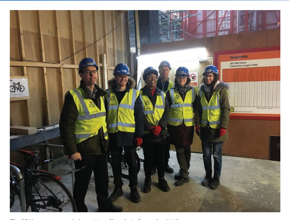
The SOM team on a workplace visit to Skanska in December 2017