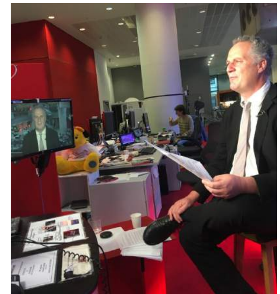
The CEO speaking at the BBC about the effect of poor sleep on work

PKF Littlejohn were appointed auditors' in 2017 and a resolution to re-appoint the 2019 auditors of the charity was agreed at the Annual General Meeting in June 2019.