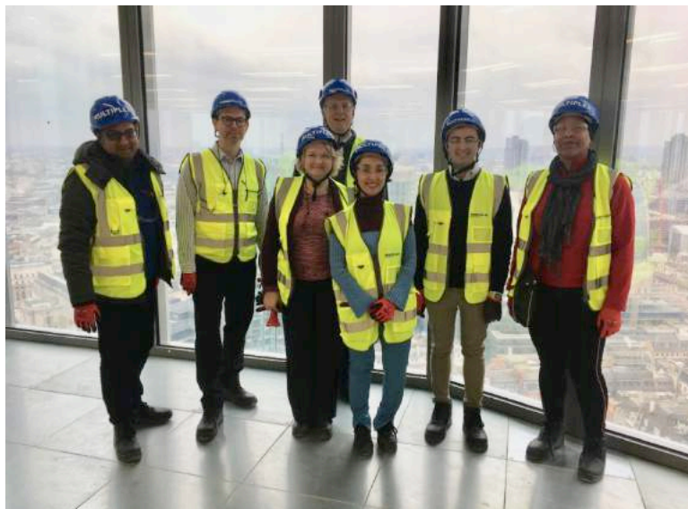
The SOM staff at a workplace visit at 22 Bishopsgate

The SOM's reserves support the SOM's aim to provide the necessary infrastructure with respect to administration and premises. Regular meetings with the SOM's investment managers to review the portfolios take place to ensure that an appropriate, ethical and productive reserves policy is maintained. Funds can then be available to support the charity's aims and objectives and to facilitate improved administrative processes, through