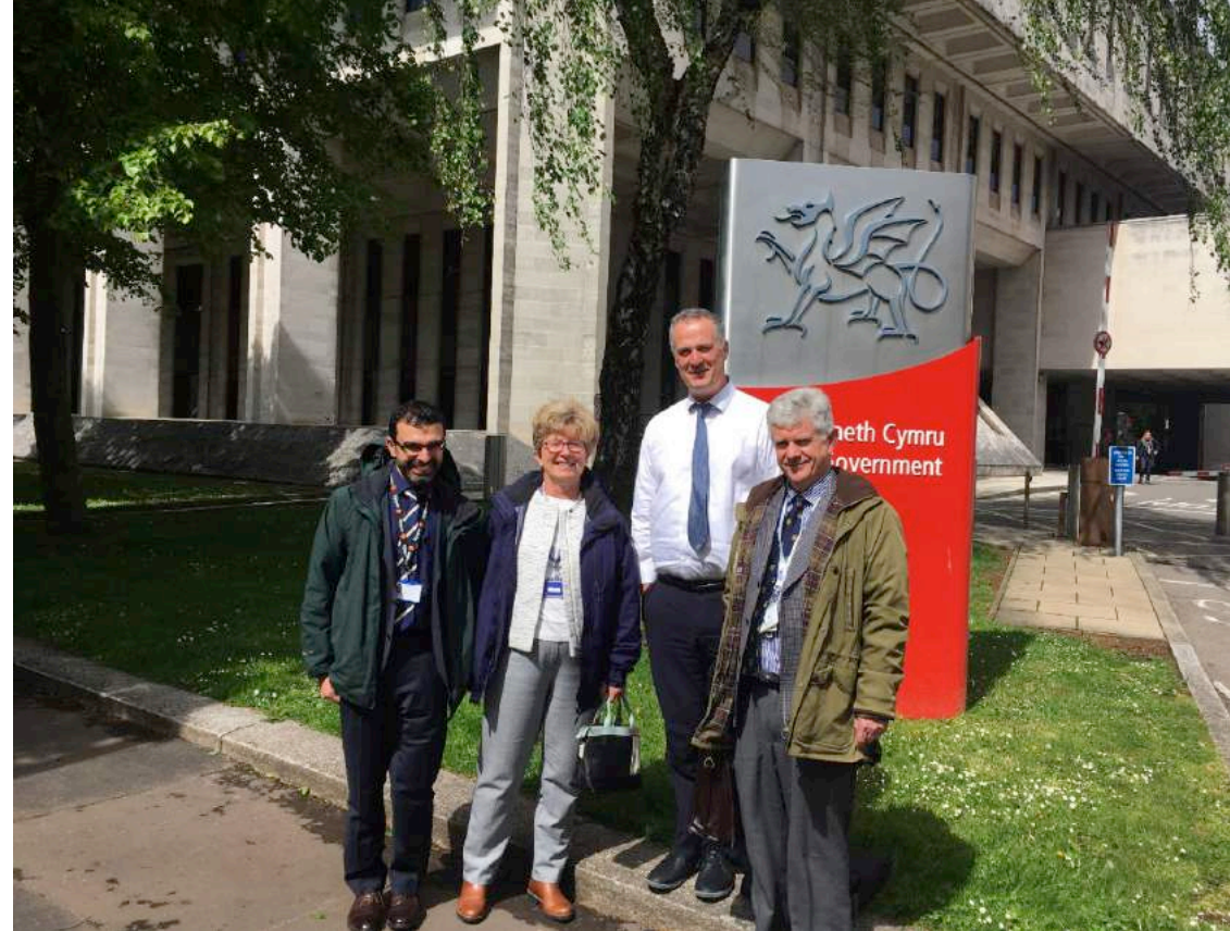
The CEO visited the Welsh Government with members to lobby the CMO about Occupational Health Trainees

By the end of 2019 SOM had over 12 Corporate Supporters and also generous sponsorship of our new OH Awards. SOM was re-accredited for ISO 9001 for our appraisal service.