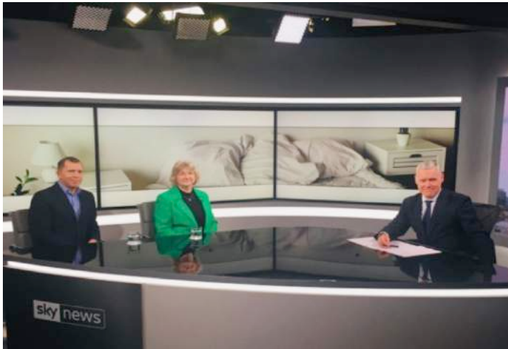
The SOM Honorary Clinical Adviser appeared on Sky News to talk about sleep and work

modernisation of information technology systems, and to support the educational activities of the Society's regional groups. This investment in turn supports the membership and promotes good practice and governance. It is the Society's target to maintain a level of free reserves to cover six months core expenditure. Free reserves in the Central Fund at the year-end amounted to £402,656 considering the net book value of fixed assets. This exceeds 5 months' core expenditure and is satisfactory. The reserves policy was reviewed by the Board in June 2019.